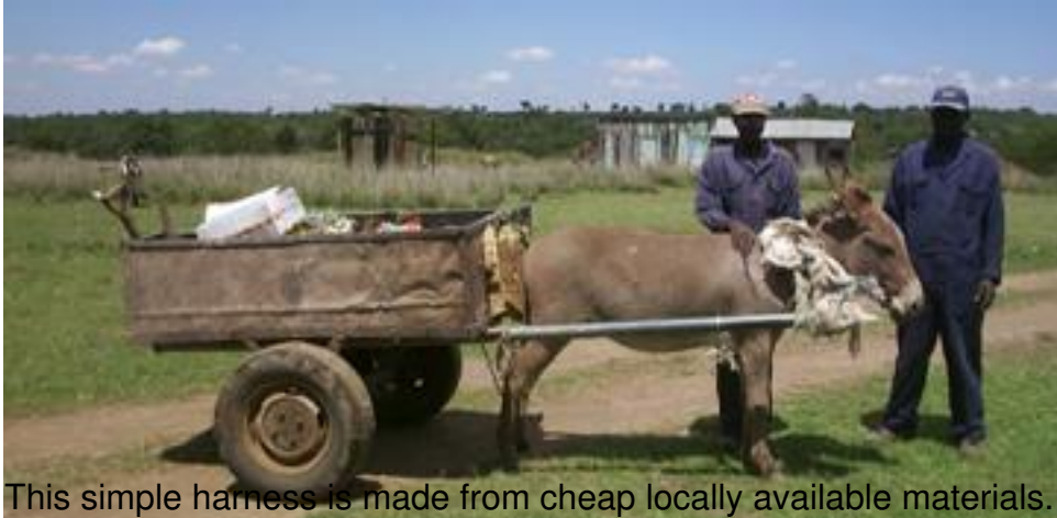
This simple harness is made from cheap locally available materials.

Its main limitation is that the vertical load from the cart is taken on the neck and not the back.